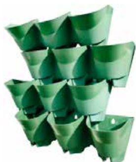
Model: Wonderwall Medium Kit