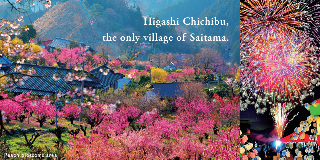
Peach blossoms area

Higashi Chichibu, the only village of Saitama.