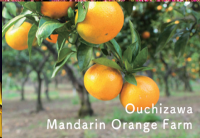
Ouchizawa Mandarin Orange Farm