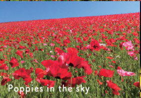
Poppies in the sky