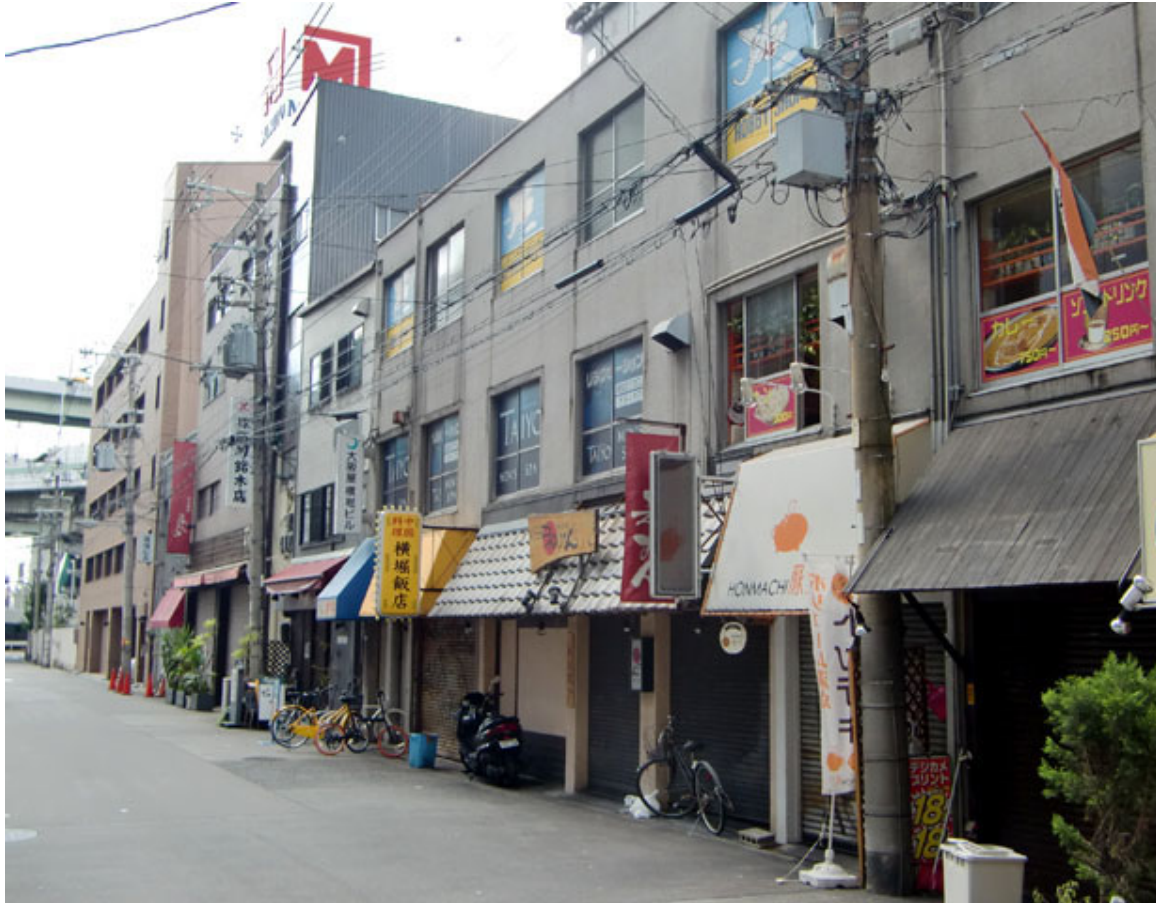
8. You will see the Hobby Land elephant logo of the 3 rd floor.