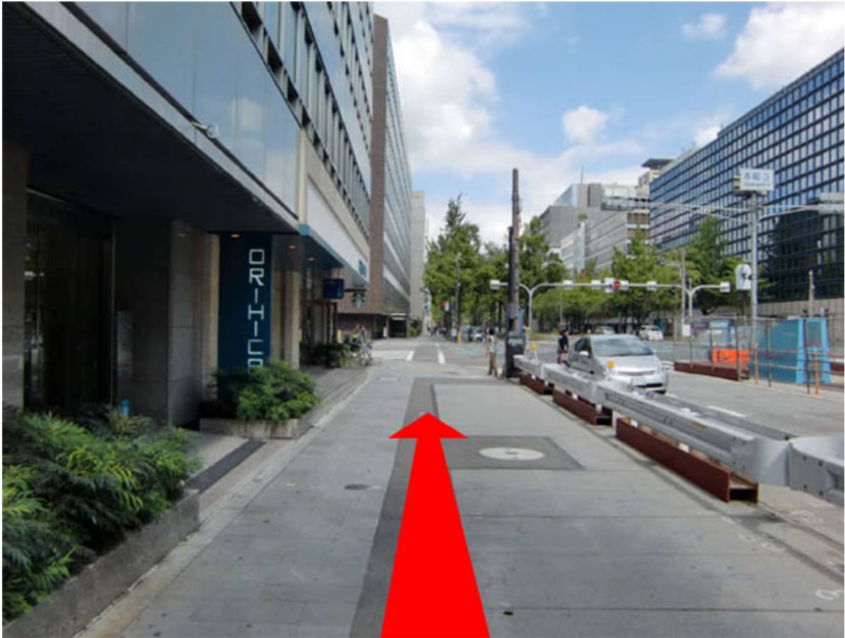
3. There is a big intersection and Starbucks is right on the corner.