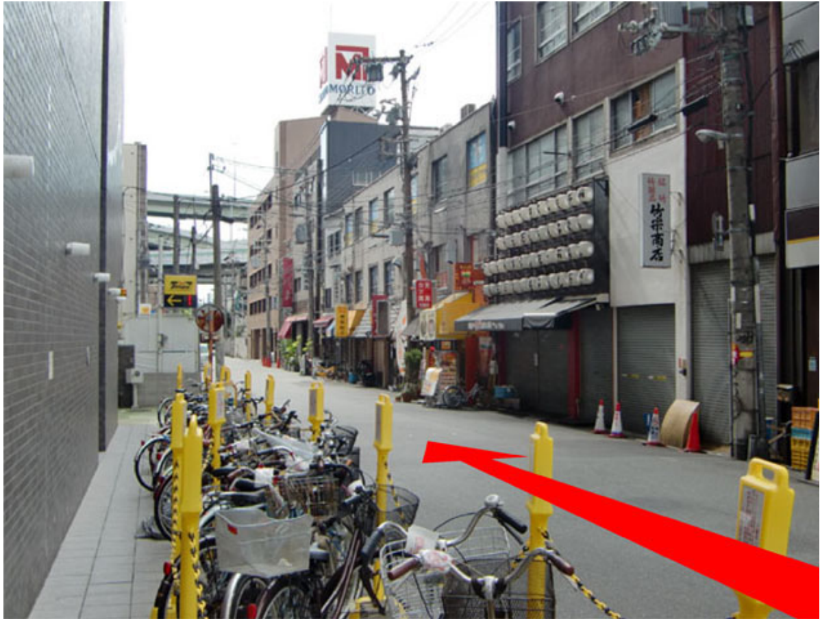
7. You will see 大阪屋横堀 building on your right side after 30 meters walk