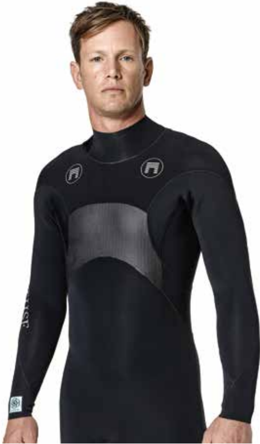
HOPLITE FULLSUIT 4/3 MM ¥79,000