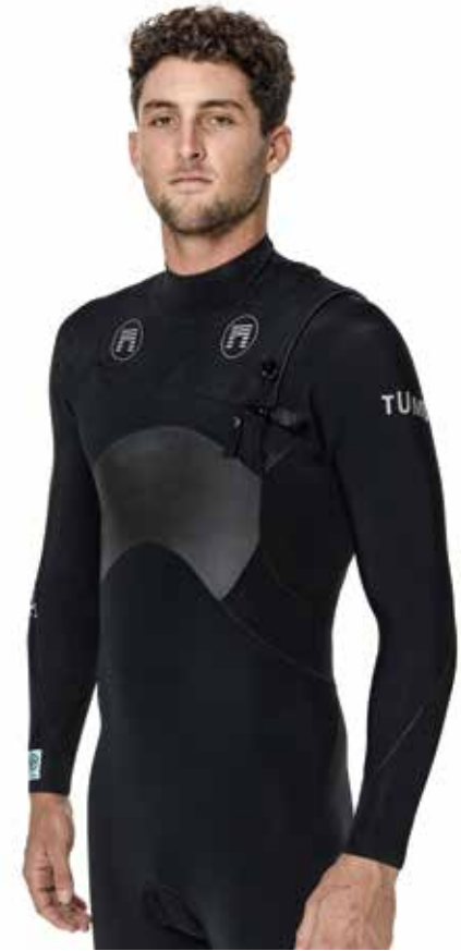
TUMO FULLSUIT 4/3 MM ¥79,000