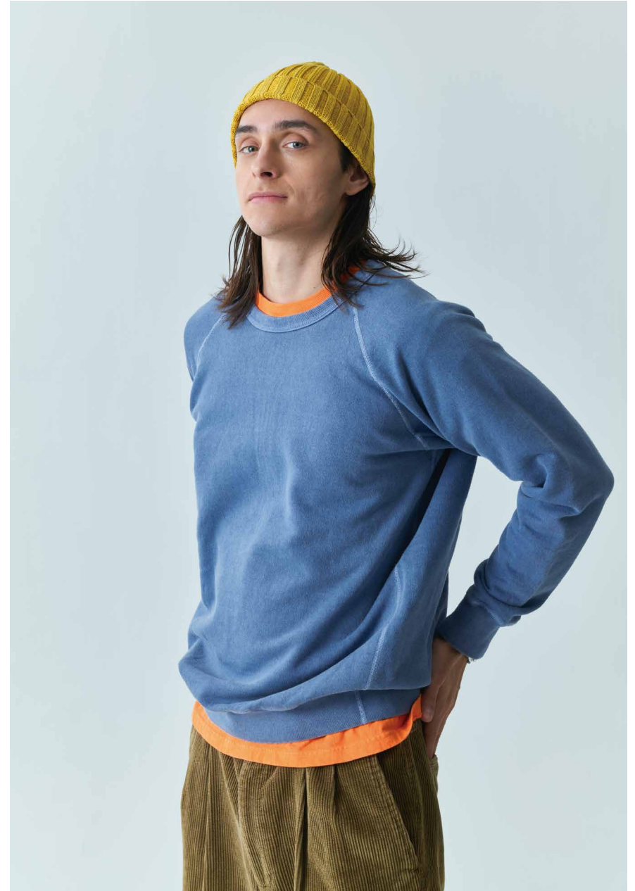
RAGLAN CREW SWEAT ¥11,880 S/S CREW TEE ¥4,950 COTTON WATCH CAP ¥5,940